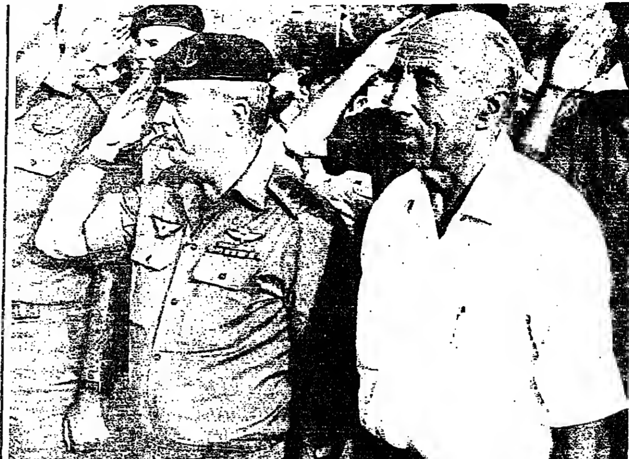
Chief of Staff Rafael Eitan (left front) joins the father of a paratrooper who fell in defence of the country at a memorial ceremony yesterday.

3 soldiers killed in road accident. ZICHRON YA'ACOV (Itim). — Three soldiers were killed yesterday in a road accident in Wadi Milh near here when their Carmel sedan collided with a tractor which had swerved suddenly.